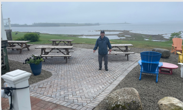
Our new Patio