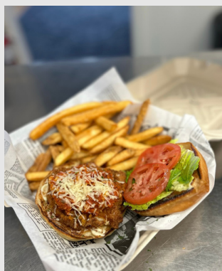
Special Chicken Parm Burger