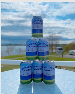
CGC Long Drive Lager